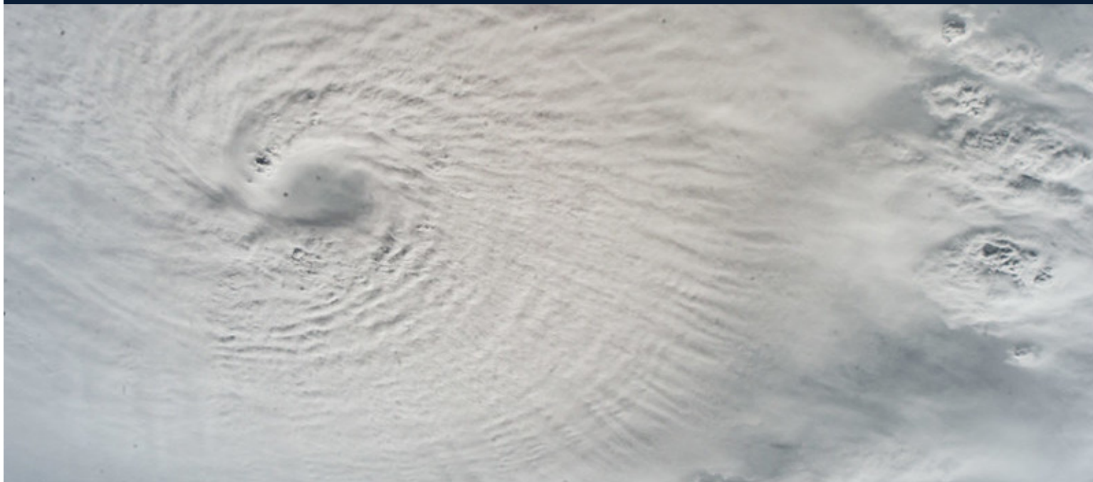
Photo of Hurricane Milton in the Gulf of Mexico