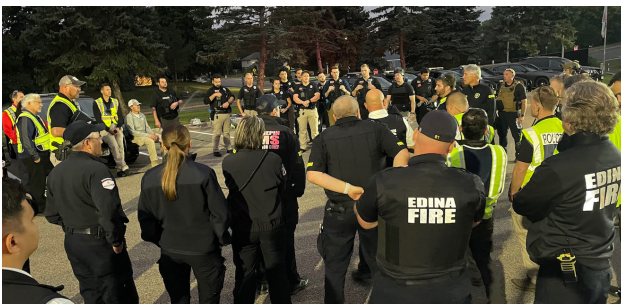
Last year, the agencies practiced an active threat training at an Eden Prairie school.

Eden Prairie Fire, Police, and Hennepin EMS held our annual active threat training on September 4, 10, and 17. This year, the trainings took place at a city building after hours. Together, we practiced drills to stop an assailant, evacuate the scene quickly and treat/prioritize transport of patients. We appreciate the coordination and collaboration that goes into these trainings, which help us stay ready for any and all types of emergencies.